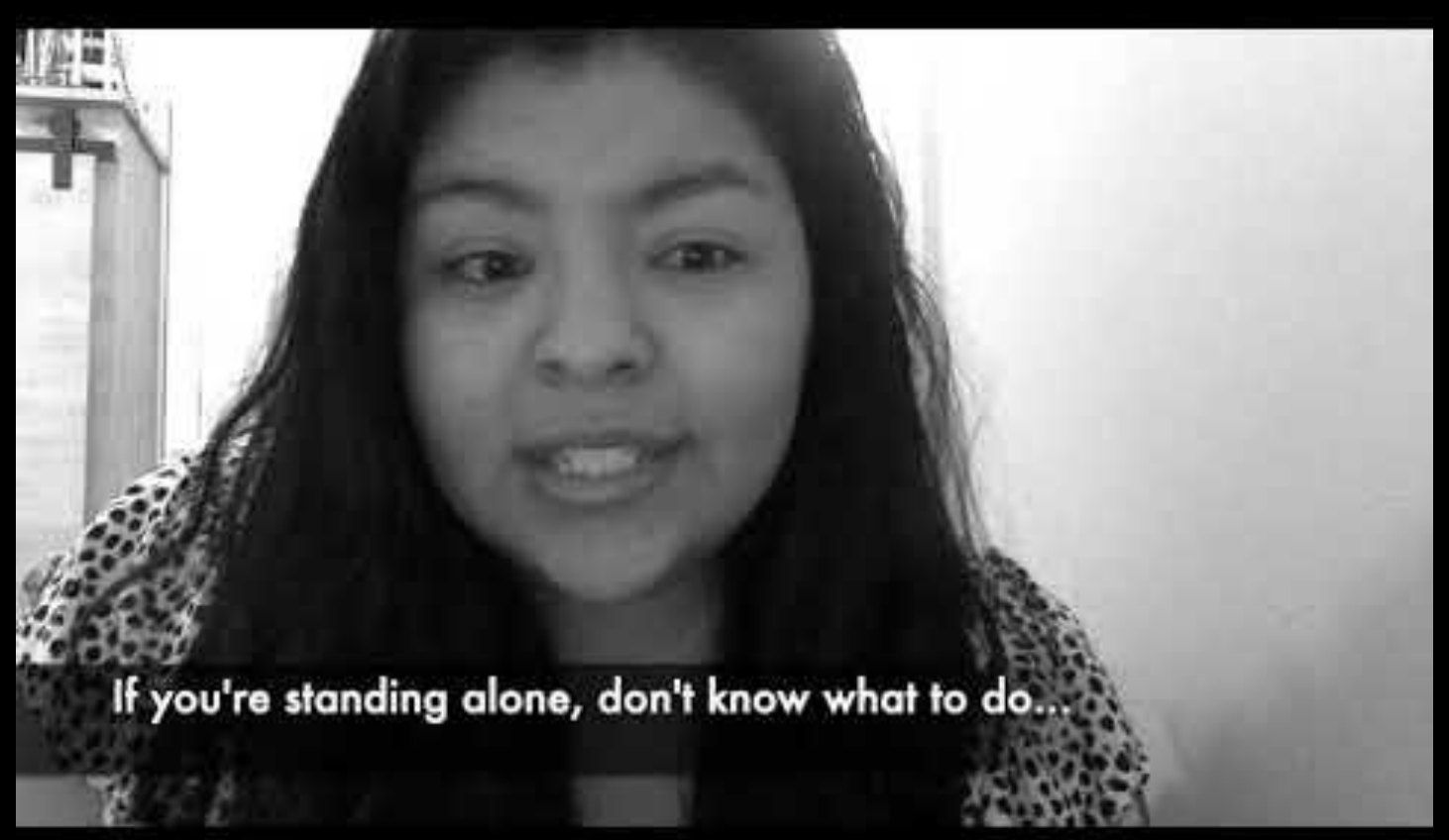
Read-aloud by Nashville Classical staff.