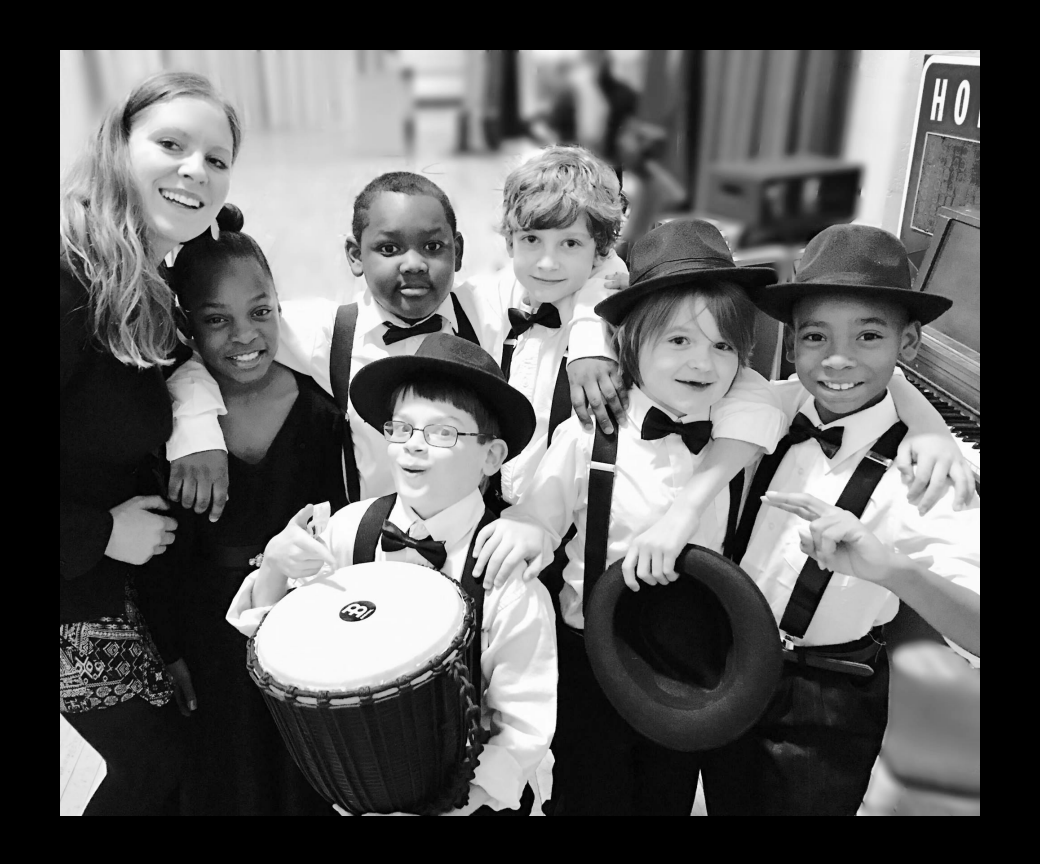
Click on photo to watch choir performance of original song, "Sing It Out Loud":